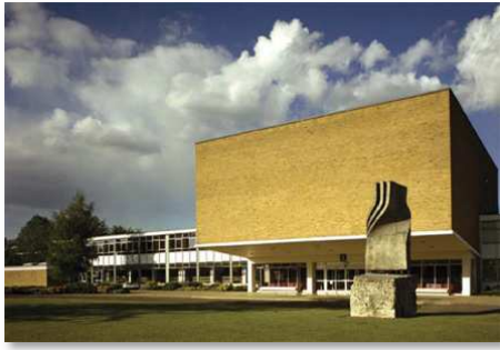
Culham Conference Centre, near Abingdon